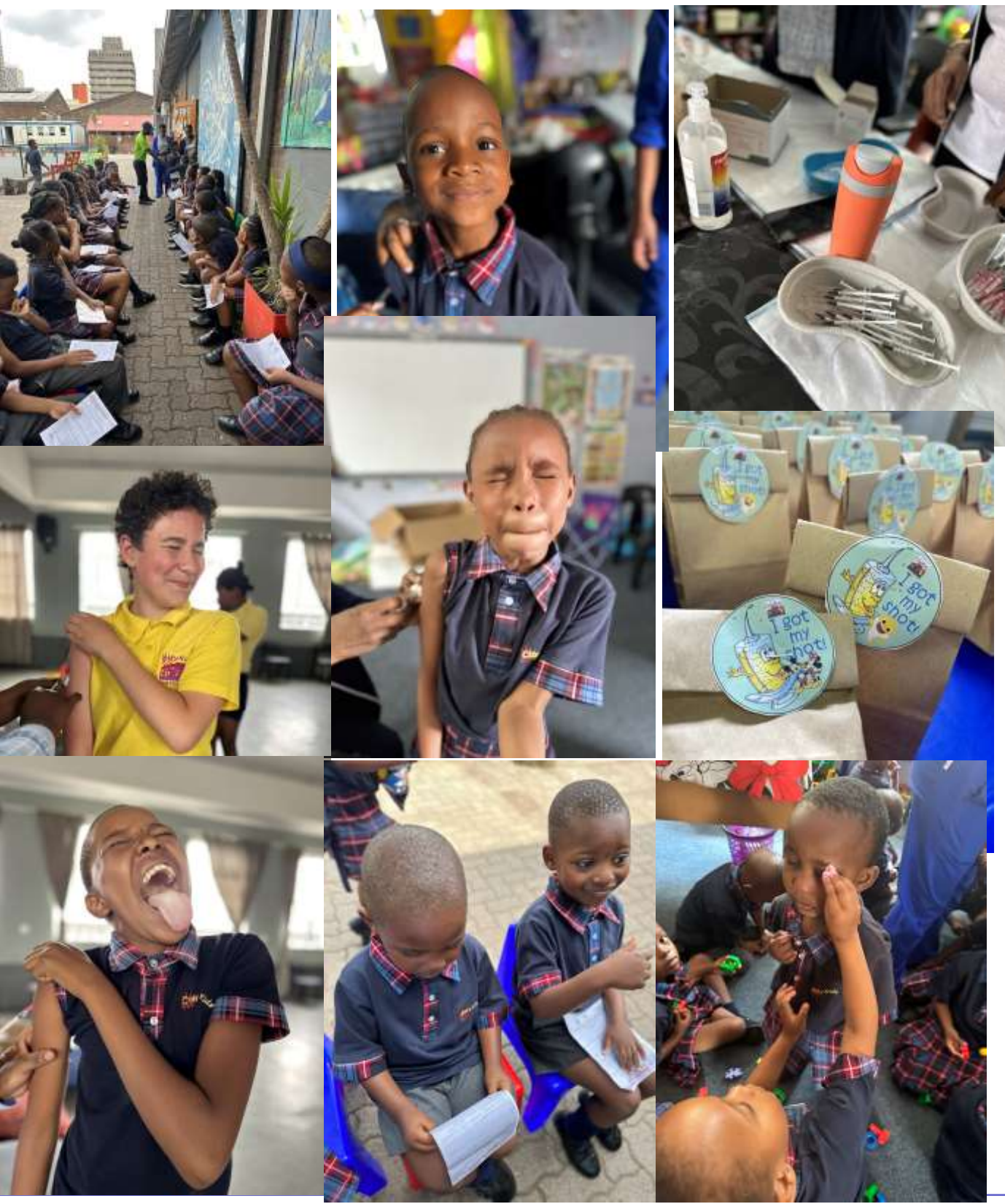
Edition 04/Term 1 Page 4

The Gauteng Department of Health conducted a province wide measles outbreak response campaign . The measles outbreak response vaccination campaign were used as a platform for providing Vitamin A supplementation and deworming medication to children who are due or missed their doses. All services rendered will be recorded in the Road to Health Booklet. Parents gave consent and the majority of our little ones agreed to get jabbed. Many were incredibly brave...others not fans of the needle! They can all be proud to say "I got my shot!" The RR's were rewarded with a goodie packet from their teachers!