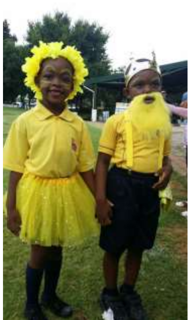
enthusiasm shown by the children.

This day was made extra special by the fantastic turn out from the parents, in spite of the earlier weather conditions, and the effort and